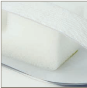
Breathable, 35mm thick foam backing for enhanced comfort during extended periods of use