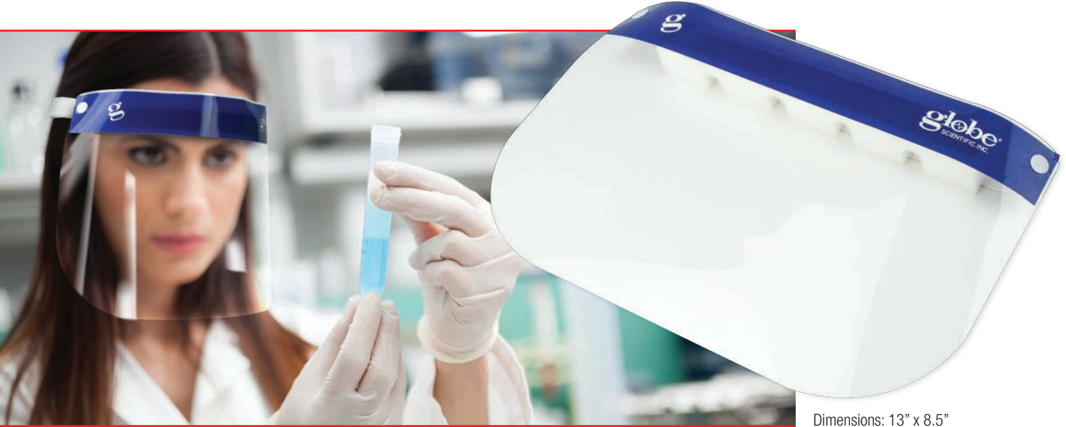
Dimensions: 13" x 8.5"

This single use safety face shield offers eyes, nose, and mouth protection from aerosols, sprays, and splatters. A comfortable elastic band and soft, breathable headband make this light-weight shield comfortable to wear even over extended periods. The transparent, distortion free PET shield provides maximum visibility and protects lab personnel and health care providers from chemical spills, spits, dust, bacteria and germs.